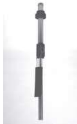
#1228 C&B 2X4

Other lengths available, at additional cost