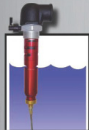
PLA150-M VLC-4 Quad Protection VLC